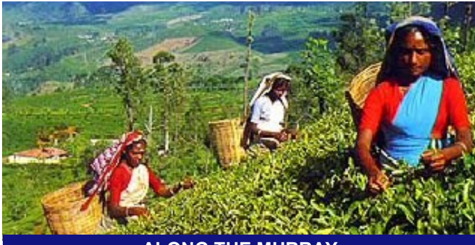
ALONG THE MURRAY

Sri Lanka is steeped in a history dating back 2,000 years and is home to some of the best preserved ancient monuments in all of Asia. A centuries old heritage lives on here in the culture and daily lives of the Sri Lankan people encompassing a rich tapestry of cultural practices, beliefs and traditional ways of life. Tour the island's surprising north to discover the beauty and cultural richness of this Indian Ocean jewel and its welcoming people. Explore a path less travelled, UNESCO World Heritage sites, old arts and crafts, vibrant bazaars, charming colonial architecture, wildlife and fabulous cuisine on this niche tour.